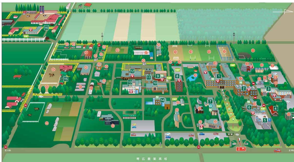
施設名 (Name of Facilities)