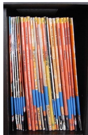
Side view of books with blue tape for non-fiction and no tape for fiction books.

At the end of 2016, we moved non-fiction books that have Moodle quizzes. They were on a table. Now the table is gone, and the fiction and non-fiction books are mixed together on the rotating book racks. That gives students more space to look for books. To make it easier to find non-fiction books, each one now has colored tape on the side. ( See the colored table below with RL number and tape color. ) When you look for non-fiction books, please check the side of them. Non-fiction books have a lot of categories, for example, biography, science, culture, sports and