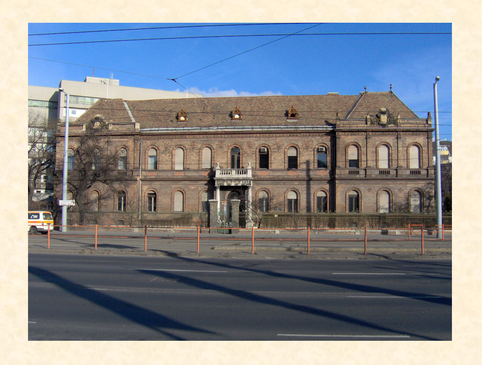
Department of Microbiology and Infectious Diseases 8